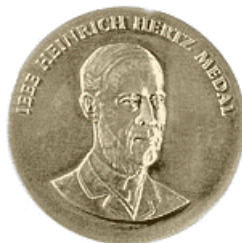
IEEE's Heinrich Hertz Medal